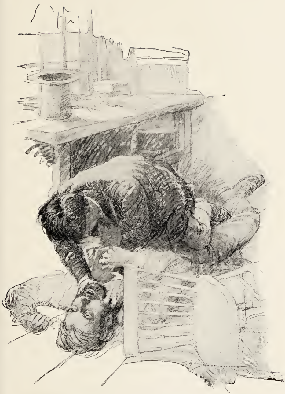
His fingers twined about the purplish throat.— Page 211